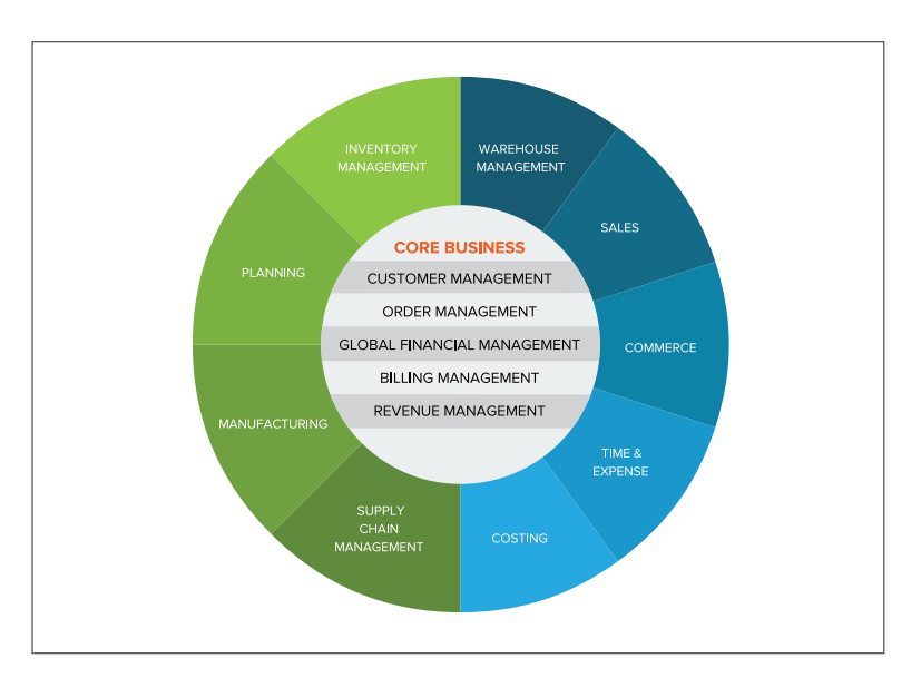
Figure 1: NetSuite provides a full business solution for manufacturers.

Since it's a cloud-based application, manufacturers can benefit from NetSuite's rich functionality immediately, and at lower upfront costs, than legacy approaches.