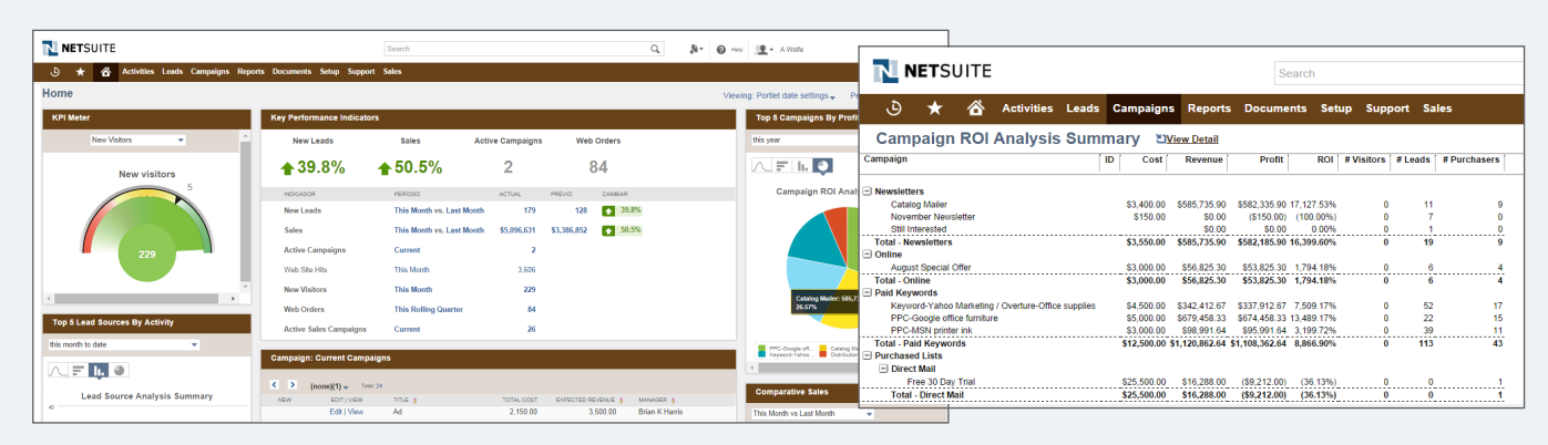
Gain a true 360-degree view of the customer lifecycle—from suspect to quote, order management, project delivery, and beyond—from anywhere at any time.